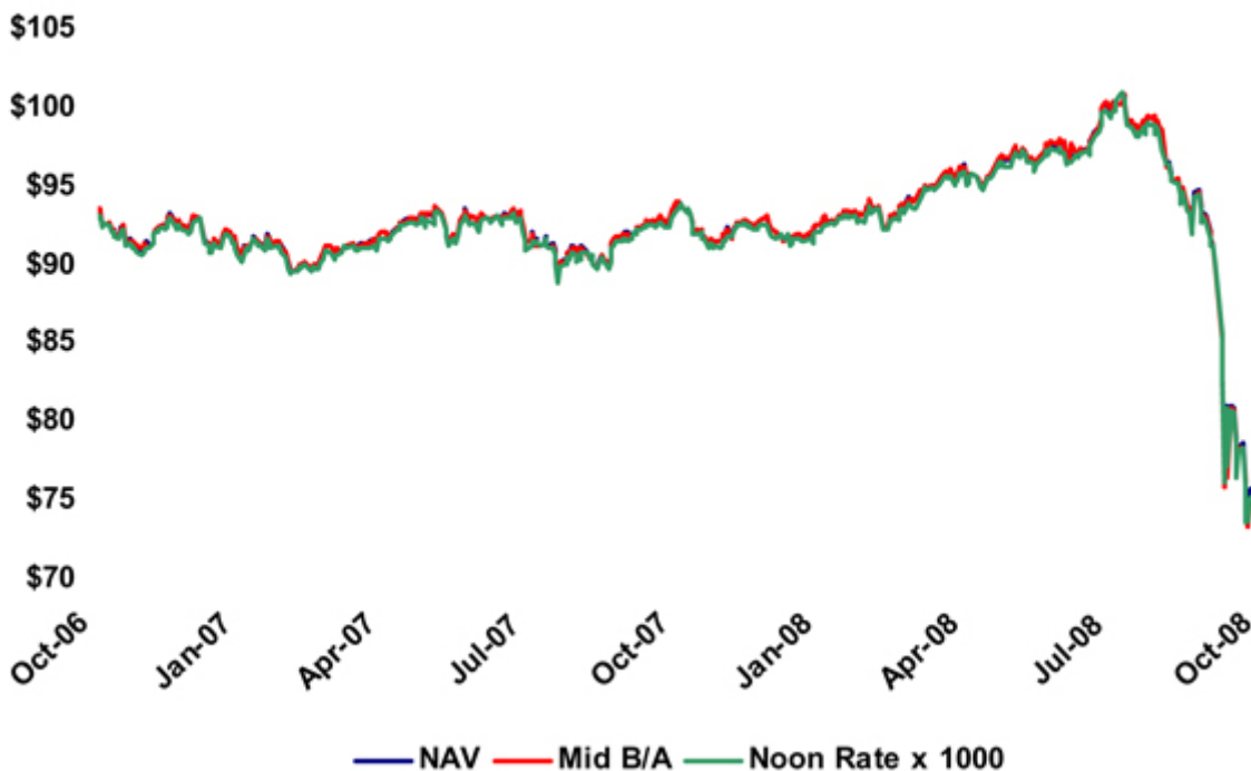
FXM Price Movement

The following chart illustrates the movement in the price of the Shares based on (1) NAV per Share, (2) the “bid” and “ask” midpoint offered on the NYSE (prior to October 30, 2007) and NYSE Arca (on or after October 30, 2007) and (3) the Noon Buying Rate, expressed as a multiple of 1,000 Mexican Pesos (Noon Buying Rate x 1,000):